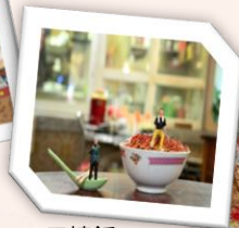
叉燒飯 Char Siu Rice (BBQ Pork Rice)