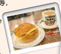
冰室/茶餐廳 Cha Chaan Teng (HK Style Cafe)

Enjoy the delicacies in Kowloon City, from Canton style BBQ meat, Hong Kong style cafes, Thai cuisine to modern cafés.